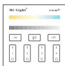
B2 / T2