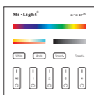
B4 / T4